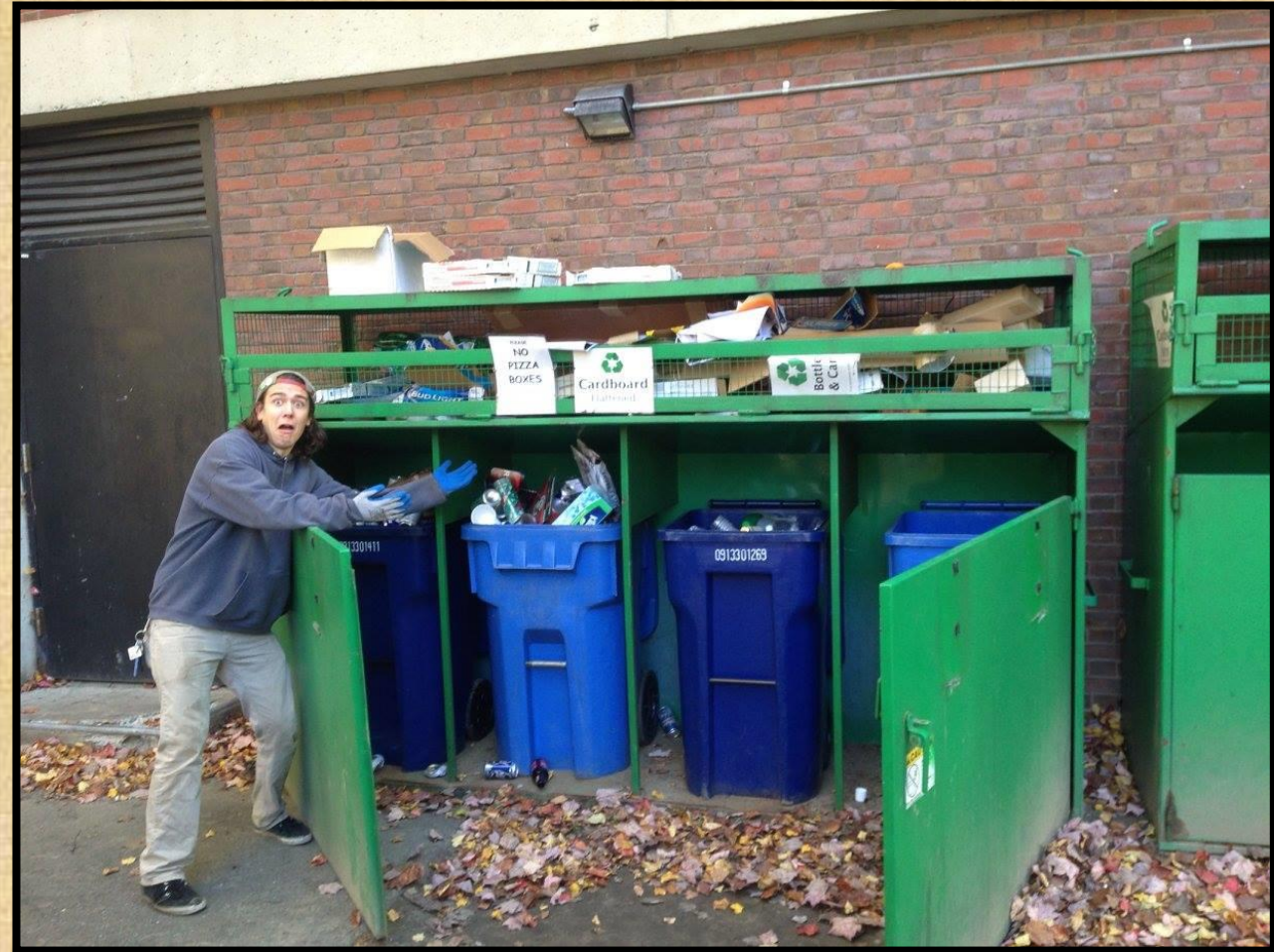
Recycling & Waste Reduction in Campus Housing (CURC/KAB Webinar Series)