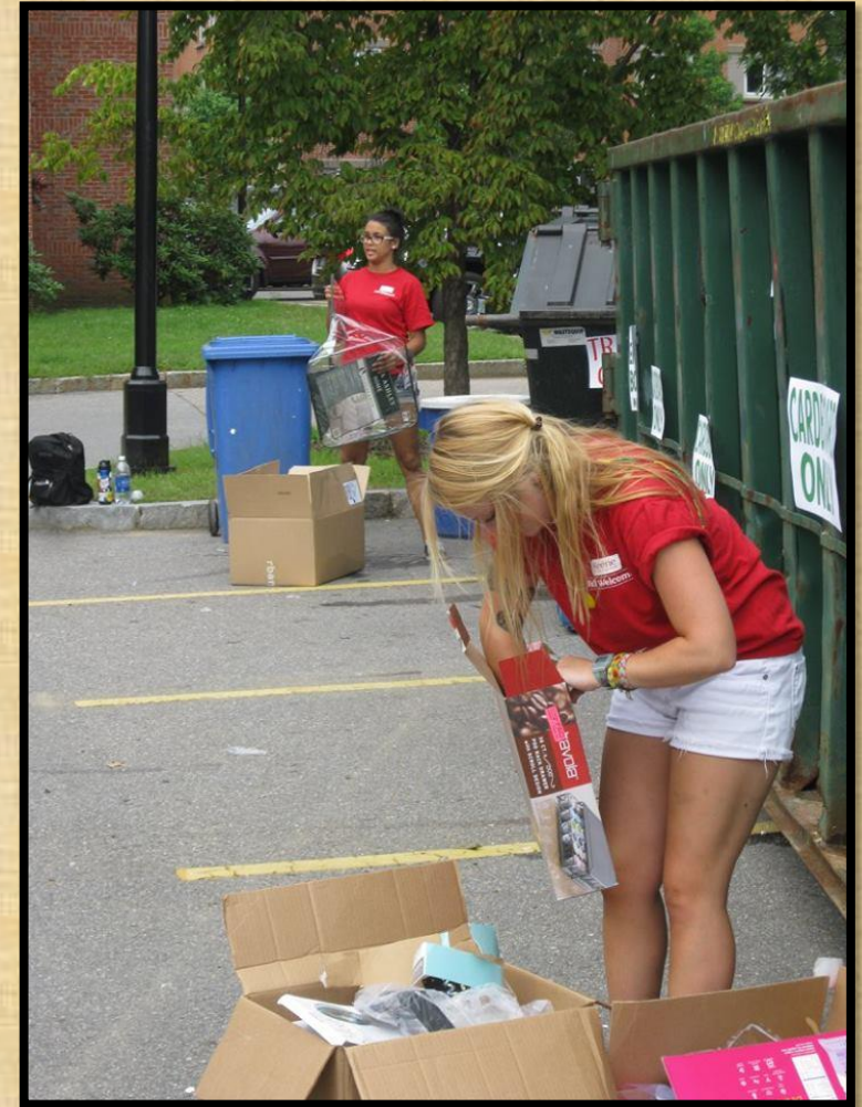
Recycling & Waste Reduction in Campus Housing (CURC/KAB Webinar Series)