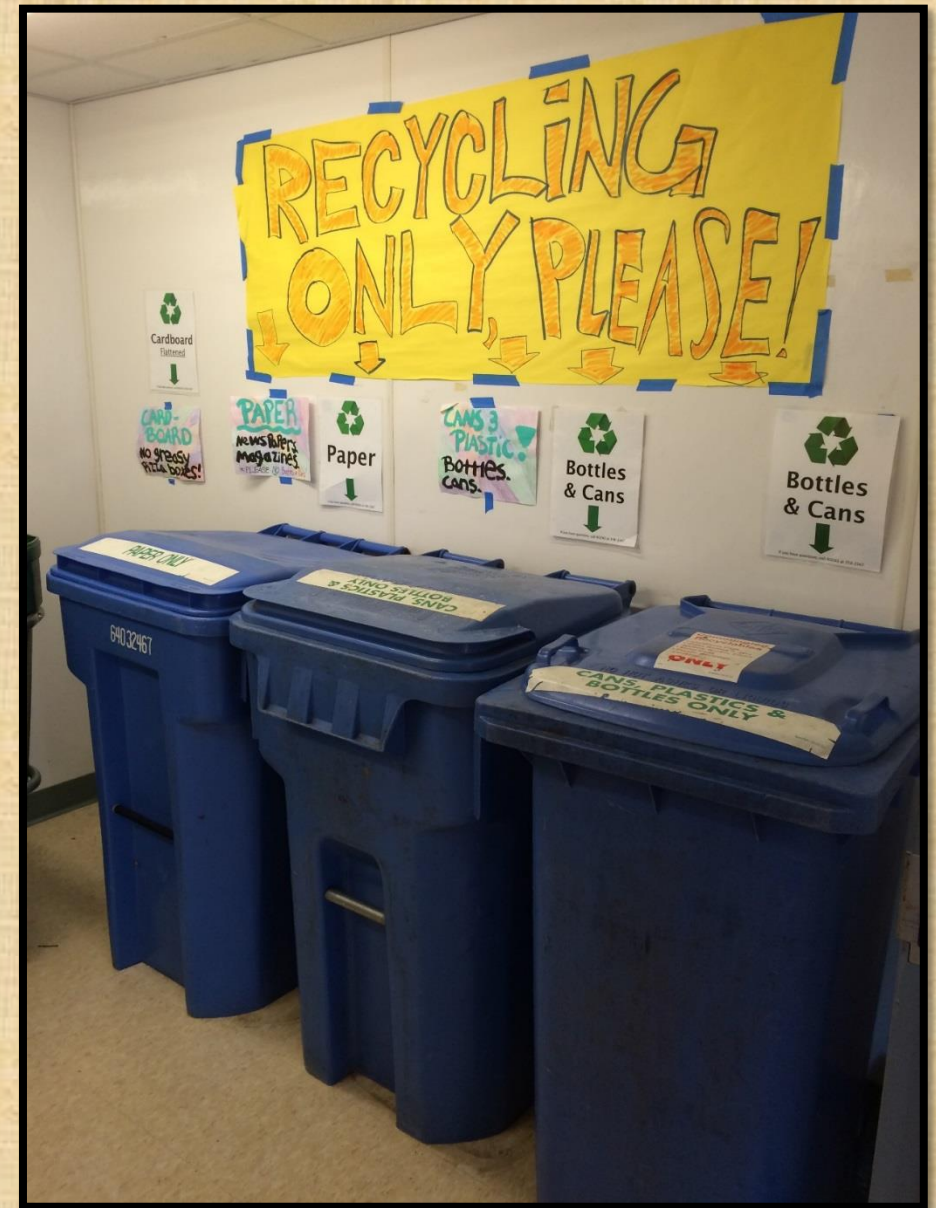
Recycling & Waste Reduction in Campus Housing (CURC/KAB Webinar Series)