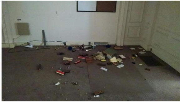
Did a hurricane hit?