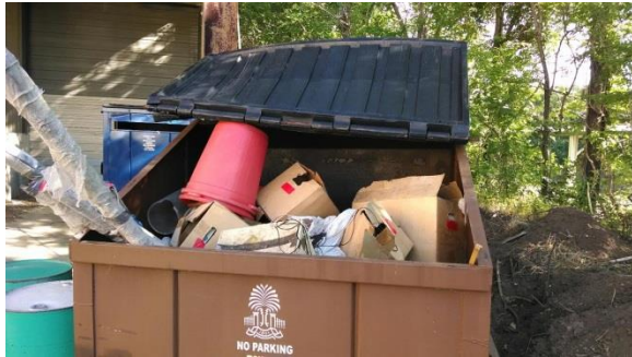
That's not trash!