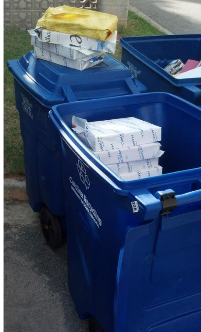
Brand-new paper in the bins