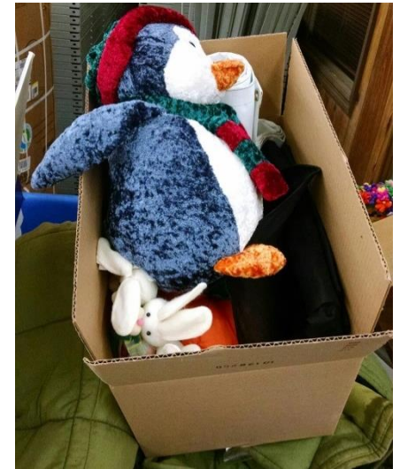
Stuffed animals Desk organizers