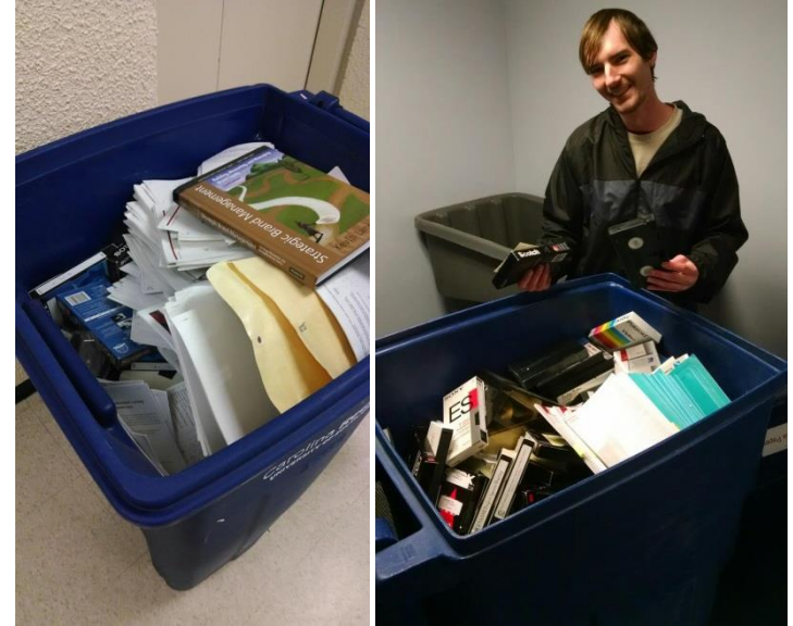
Non-paper in the bins