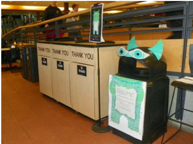
The Beast bins in Reeve Union