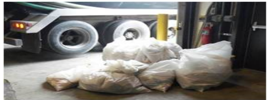
A week's worth of compostable/organic material at the biodigester in the biodegradable bags