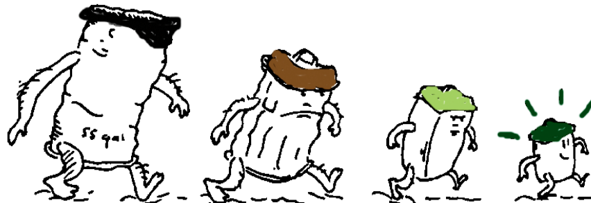
The Evolution of the waste can